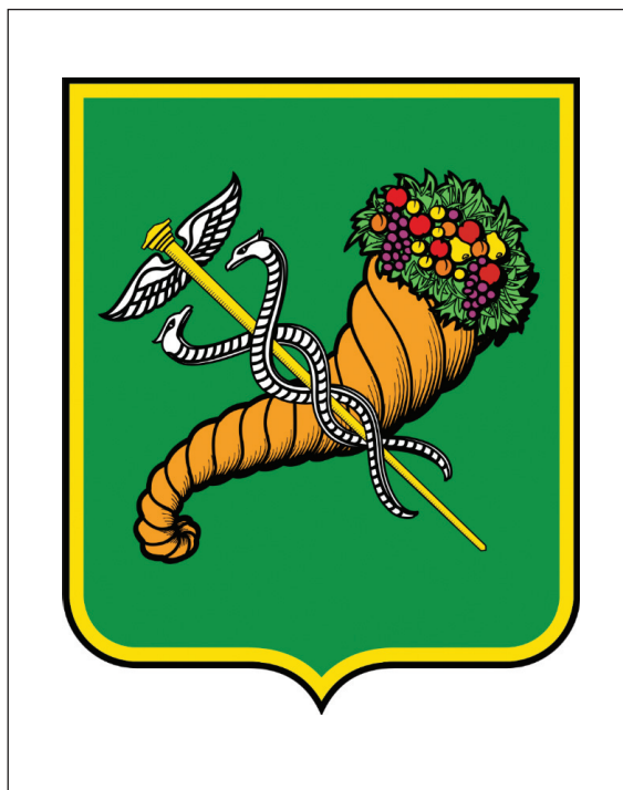
2. Kharkiv's coat of arms

of coats of arms that were later elaborated by the Master Herald A.A. Volkov. On September 21, 1781 Catherine II wrote on the projects of coats of arms for Kharkiv and other towns of the Kharkiv Namestnichestvo, “To be thus.”