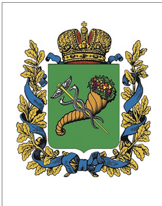
4. The Kharkiv Province coat of arms as the official emblem of the province until 1917