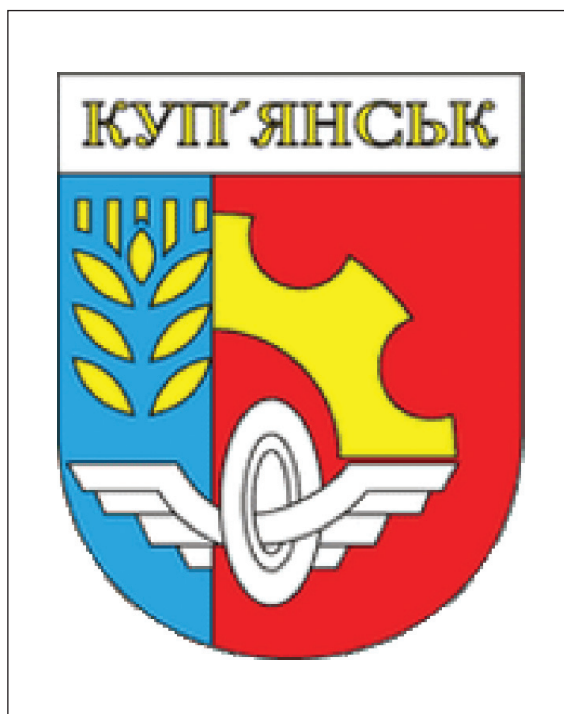
8. Coat of arms of the town Kupyansk (1970)

In studying the emblem-making of the 1990s and early 2000s in the Kharkiv Region, we can discern several directions in this process and some contradictions in the approaches of emblem creators to their work.