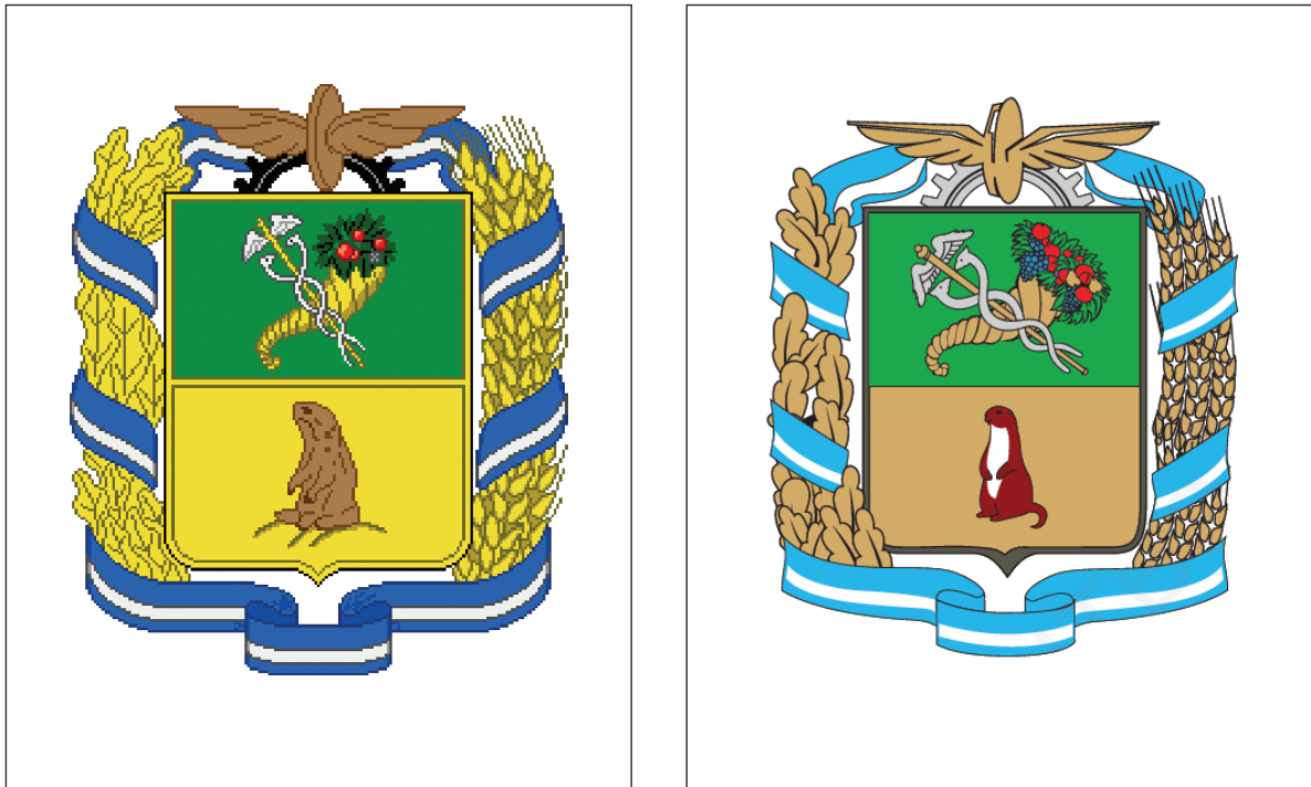
9. Coat of arms of the town Kupyansk — variations of the image of the coat of arms (2000)

The emblems of the Kharkiv Region do not represent a system, although some common elements certainly are in evidence. For example, all the districts in the region have coats of arms, but not all of the district “capitals” have acquired them: Borova, Velykyi Burluk, and Derhachi remain armless. Sometimes the emblem of the district town serves as that of the entire district. Thus, the coats of arms of Kupyansk and the Kupyansk district are identical (it was the town’s coat of arms that was approved first in 2000, and the district emblem followed in 2002). Conversely, the arms of Lozova and the Lozova district have nothing in common save for a vine ( loza ). In this case, the district arms were approved first in 1999, and the town’s came rather later in 2009. In addition, we may note that Lozova’s coat of arms is composed according to the rules of heraldry, unlike the district’s, which can be explained by the ten-year chronological gap. But, significantly, there have been no attempts to make changes to these emblems in order to bring them into agreement.