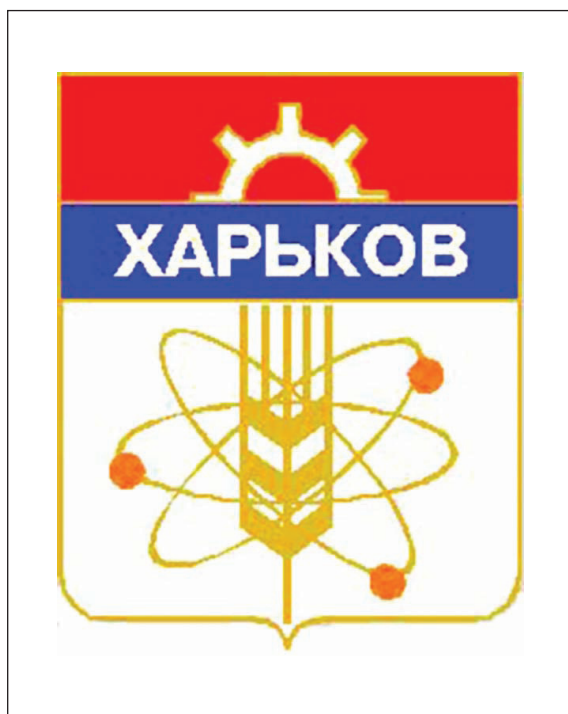
5. A new emblem for Kharkiv, created in the 1960s